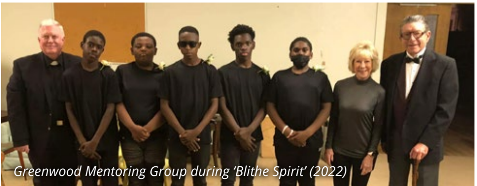
Greenwood Mentoring Group during 'Blithe Spirit' (2022)