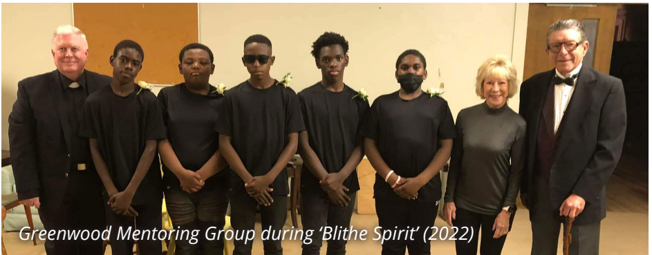
Greenwood Mentoring Group during 'Blithe Spirit' (2022)